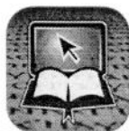
Blue Letter Bible