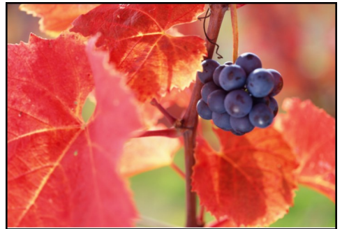
Isaiah's Vineyard Song

A shoot shall come out from the stump of Jesse, and a branch shall grow out of his roots. 2 The spirit of the Lord shall rest on him, the spirit of wisdom and un- derstanding, the spirit of counsel and might, the spirit of knowledge and the fear of the Lord.