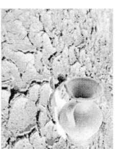
Cleansing the Temple

Background: In the Gospel of John, the cleansing of the temple was Jesus’ first act once his ministry began. (In the other three gospels, it happened just before his crucifixion.) In John’s gospel, Jesus used signs to point toward God, always redirecting people’s attention away from himself, and toward God in heaven.