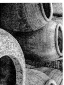
Wedding at Cana

Key Verses: “When the wine gave out, the mother of Jesus said to him, ‘They have no wine.’ And Jesus said to her, ‘Woman, what concern is that to you and to me? My hour has not yet come.’ His mother said to the servants, ‘Do whatever he tells you.’” John 2:3-5